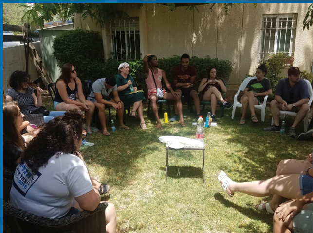
A discussion group on the Fact Finders trip to Israel

Choosing Hillel was a choice that didn't need much thought. When I first connected through a table on campus, I did not know what Hillel was. After my first visit, I never wanted to leave. From the very beginning, students seemed excited to welcome me as someone new, asking me about my journey getting to Hillel and trying to get to know me. Now I'm an intern and I love making sure Hillel is as open and inviting for others as it was for me.