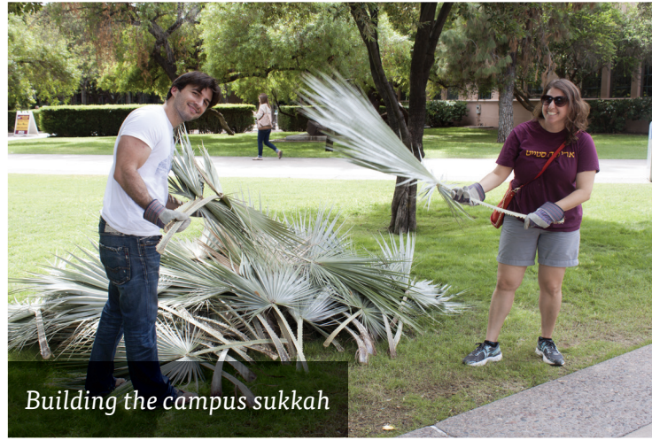
Building the campus sukkah