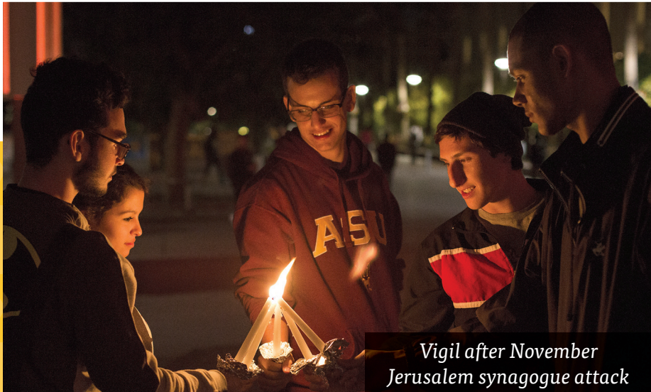
Vigil after November Jerusalem synagogue attack