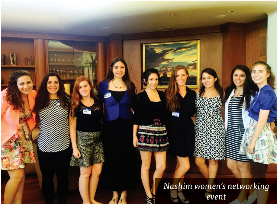
Nashim women's networking event