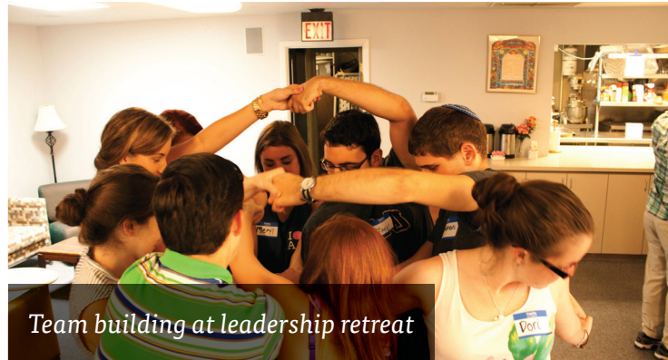
Team building at leadership retreat