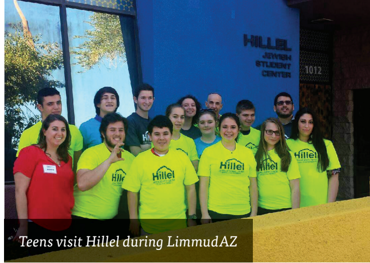
Teens visit Hillel during LimmudAZ